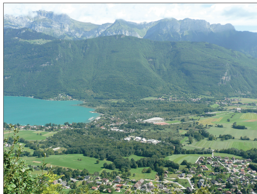
Figure 1: The landscape of the Petit Lac d'Annecy catchment, Haute-Savoie, showing the southern end of the lake, the Eau Morte River delta, the intensively farmed lowlands, forested lower slopes and alpine pastures.

ber of studies, drawing on methods used in paleoecology, environmental history and process modeling, to investigate the links between human activities, climate and hydro-geomorphic processes. Lying at an altitude of 447 m asl in the prealps of Haute-Savoie, the lake comprises two basins, the Grand and Petit Lacs. Integration of data and models from mainly the Petit Lac and its catchment (Fig. 1) has generated significant insight into the spatio-temporal nature of human-environment interactions across the wider region.