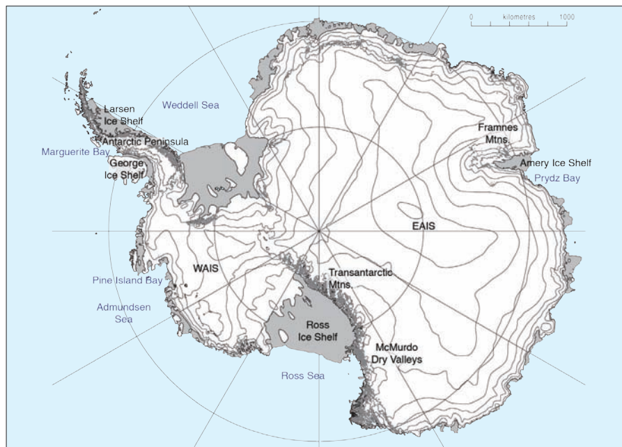
Figure 1: Map of Antarctica showing locations mentioned in the text.

Similarly, the onshore studies using exposure dating have shown different behavior in different sectors of the ice sheet. Stone et al. (2003) demonstrated continuous thinning of the West Antarctic Ice Sheet in the eastern Ross Sea for at least the last 10 kyr and continuing today, whereas on the Antarctic Peninsula Bentley et al. (2006) showed that the ice thinned and retreated close to its present limits by 9.6 kyr. A similar result was noted for the Framnes Mountains in East Antarctica, where the ice was close to its present elevation by 6 kyr (Mackintosh et al., 2007).