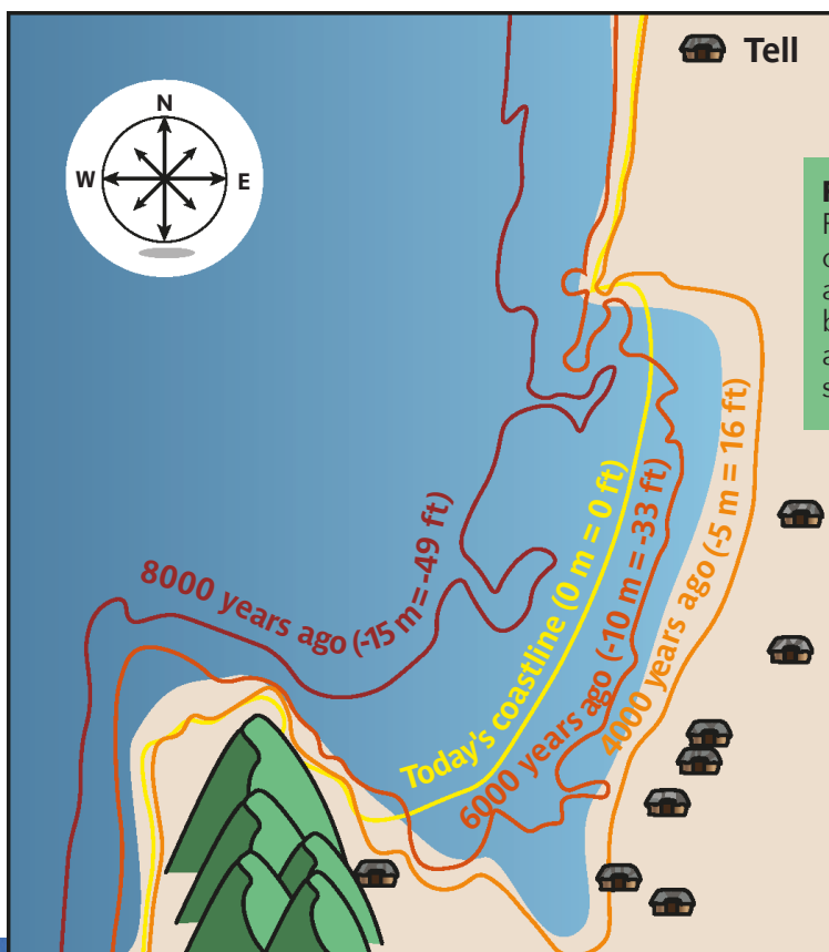
Figure 2: Reconstruction of past coastlines along Haifa Bay, based on location and dates of coastal sand.

To extract that information from underground, we drilled cores along Haifa Bay in the bay (west of the current coastline), the beach, and inland (east of the current coastline). In cores where we found coastal sand, we sampled and measured the age of the sand. We marked the coastline 8000, 6000, and 4000 years ago on a map. These results are very clear – the coastline moved from west to east during the past 8000 years. This also indicates that the sea level rose from about 15 m (50 ft) below today's sea level to its current level.