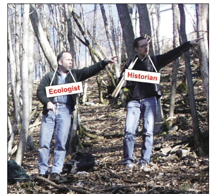
Fig. 1: Studying the human impact on terrestrial ecosystems requires an interdisciplinary approach!

The first session focused on long time scales and the early history of human impacts on ecosystems.