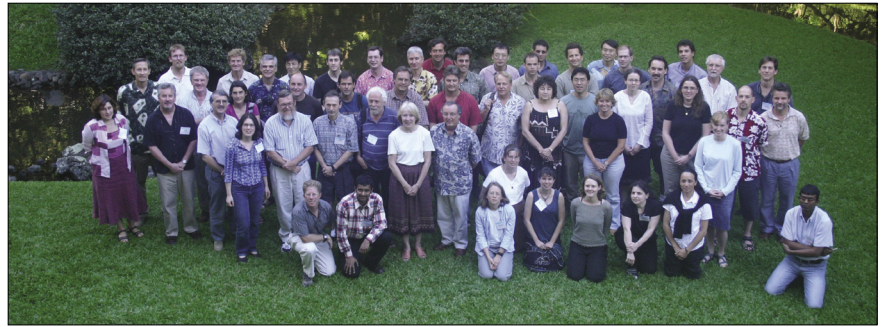
Fig. 1: The conference brought together experts in observation, theory and modeling of modern teleconnections, and in analysis of past records of climate variability.

The purpose of this conference was to bring together atmospheric scientists, oceanographers and paleoclimatologists in order to provide modern climate scientists with a better understanding of paleoclimate records, and paleoclimatologists with the opportunity to place their records into the larger context of climate processes. Climate periods reconstructed using proxy records from ocean, lake and peat sediments, fossil corals, ice cores, speleothems, paleosols and tree rings included the last millennium, the Quaternary, and the Pliocene-Miocene. Variability on millennial and orbital time scales is apparent in many of these records and they show tropical-extratropical connections but forcings can be different. Millennial variability in tropical SST records corresponds to prominent features in the North Atlantic (e.g. Younger Dryas) but have a muted response in the western tropical Pacific. Well-preserved corals in eastern Indonesia record a cooling event over ~100 years synchronous with the 8.2 ka cold event in the North Atlantic, supporting the role of atmospheric teleconnections in rapidly propagat-