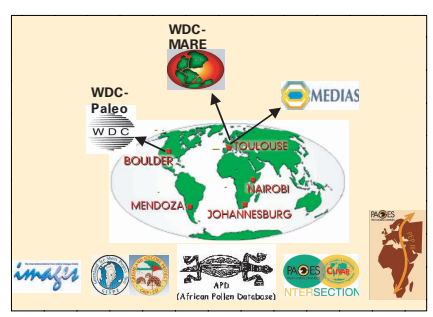
Fig. 1: Many of the data centers and data activities that are part of the PAGES Data System.

At the inaugural meeting of the new PAGES Data Board a list of planned actions and data policies was drawn up. Members in attendance at the inaugural meeting included representatives from all of the major data archives such as The World Data Center for Paleoclimatology in Boulder, USA, the World Data Center for Marine Environmental Data and PANGAEA in Germany as well as MEDIAS-France. In addition, representatives from thematic data collection efforts such as the African, European and North American Pollen databases and the IMAGES program were also present. Although participation in the workshop was necessarily limited, membership in the PAGES data board is open to all interested scientists and organizations. A full list of the proposed new PAGES Data board policies, which have subsequently been approved by the PAGES Scientific Steering Committee, is available on our web-