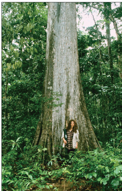
Fig. 2: Cedrela odorata tree growing at Pando, Bolivia (11°S 200m a.s.l.) in the southwestern part of the Amazon basin. The climate presents a mean annual temperature of 27°C and 1800 mm of precipitation with a marked dry period during the months of May to September. The diameters of the dominant trees reach 1.0 – 1.5 meters.

Reconstruction of low latitude climate variability has been hampered by the lack of suitable annually resolved proxy climate records. Several factors can be invoked to explain the unbalanced distribution of tree-ring records between tropical and temperate regions in the Americas. Most tropical species do not form distinct rings and when rings are present, they are not annual. Some species show clearly visible rings but the circular uniformity is uncertain. Absence of seasonality appears to be the main reason for the lack of well-defined boundary rings in the tropics. Nevertheless, there are tropical and subtropical regions that experience seasonal changes in precipitation or temperature that can induce the formation of defined growth rings. In order to fill the “tropical gap” between the presently available