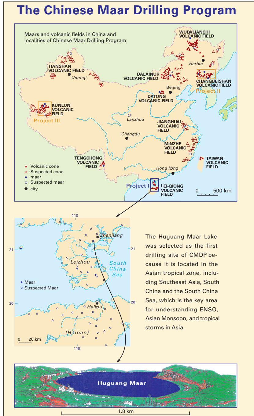
Fig. 1. The Chinese Maar Drilling Programme. Maars and volcanic fields in China and map and picture of Huguang Maar Lake.

Initial short and freeze cores in Sihailongwan maar in Northeast China provide an annually resolved re-