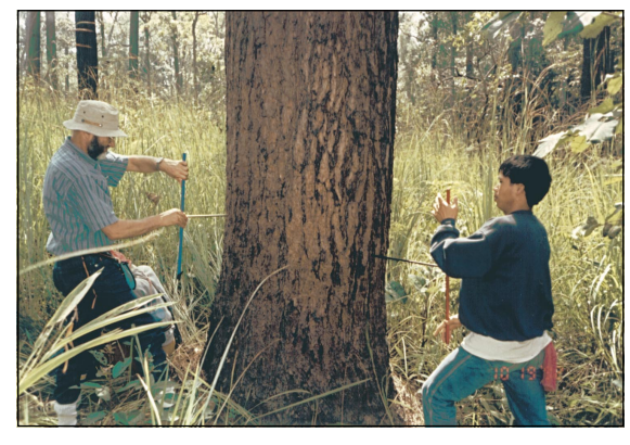
Coring old-growth Pinus merkusii from Thung Salaeng Luang National Park in northcentral Thailand

CHIANG MAI, THAILAND, FEBRUARY 16-20, 1998