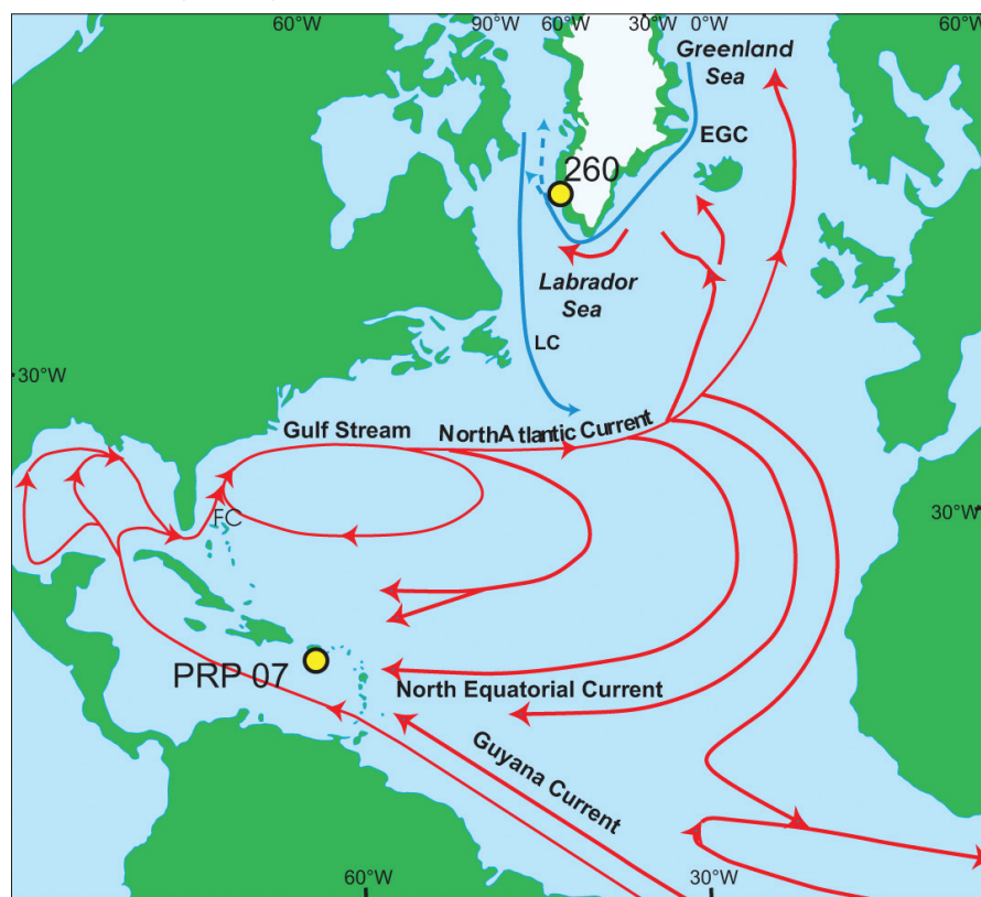
Figure 1: Map of the North Atlantic with location of gravity core 248-260-2 from Ameralik Fjord, SW Greenland and the NE Caribbean study of core PRP-07 (box core and piston core). Blue lines indicate cold Polar Water transport pathways (EGC = East Greenland Current, LC = Labrador Current); red lines and arrows show the main warm water transport pathways of the North and Equatorial Atlantic.