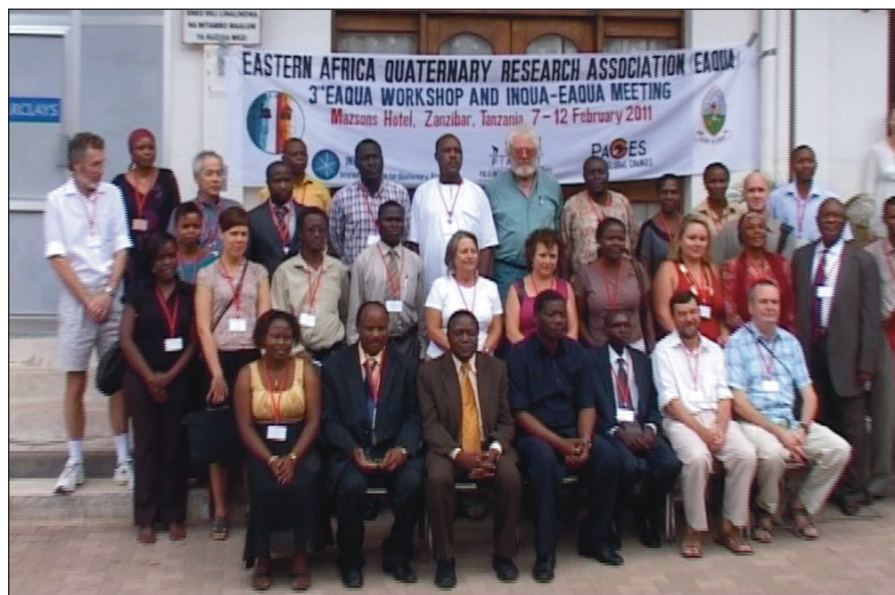
Figure 1: EAQUA meeting participants

eration and capacity development. Such treasures could help to fight poverty through promotion of ecotourism. He also reminded participants to reflect on how